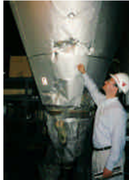
Hammer damage to hoppers impairs flow.

Vibrators as Material Flow Aids vs. Costly UHMW Liners