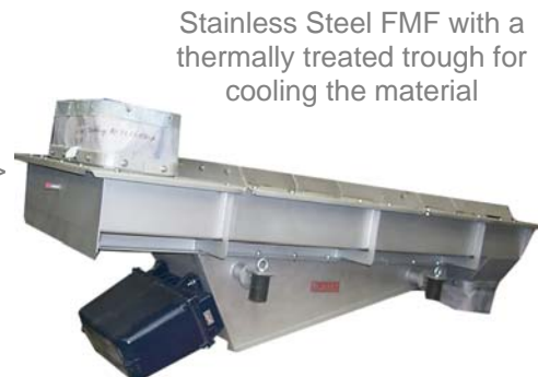
Stainless Steel FMF with a thermally treated trough for cooling the material

Dust-tight inlet collar > < Dust-tight outlet collars