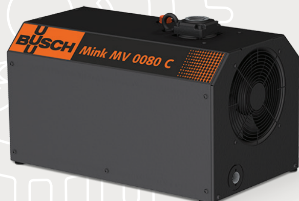
Mink MV 0080 C

Mink – the most efficient industrial vacuum generator, tailored to your process.