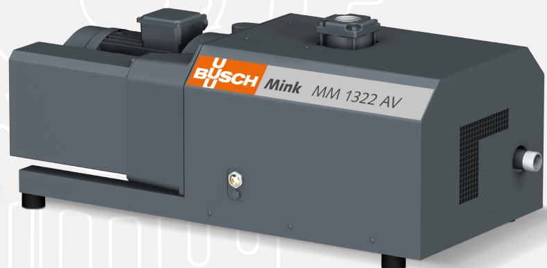
Mink MM 1322 AV

Mink – efficient and reliable vacuum generation.