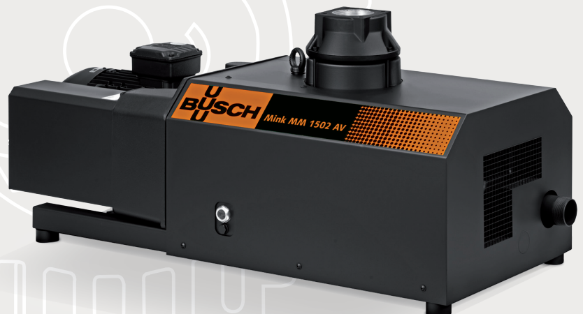
Mink MM 1502 AV

Mink – save on energy and operating costs for vacuum generation.