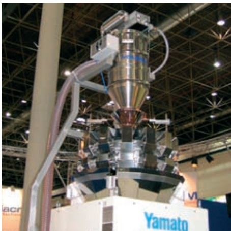
Loading of a multiple-bucket-weighing and dosing system.