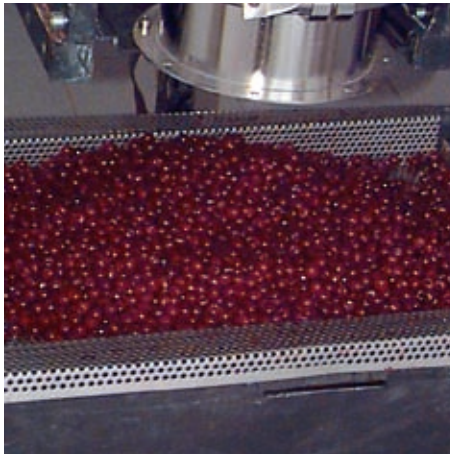
"Cherries in alcohol" transport; filled chocolate production.