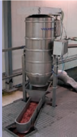
Transport of salami-slices for pizza-topping.