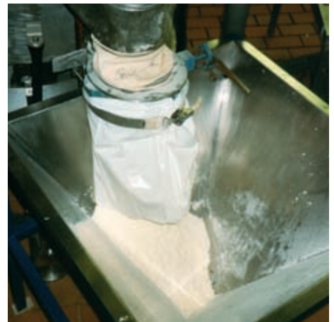
Loading of Cream-Fat powder (70 % fat) into a hopper and filling Big-Bags.