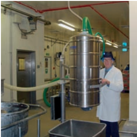
Flour transfer system in a bakery.