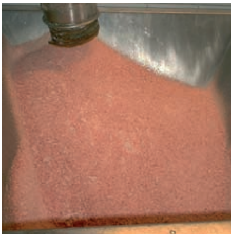
Granulated meat conveying in sausages-making process.