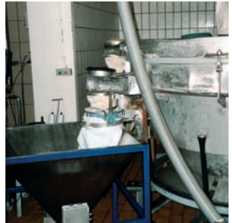
Feeding from a tumbling-sieve into a hopper for Vacuum Transfer