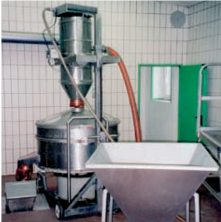
Conveying of spices from a hopper and loading of a sieve.