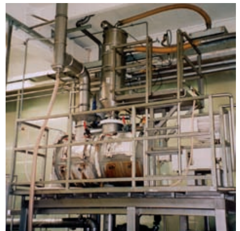
Vacuum Transport and loading of a mixer with powders for sauce-making.