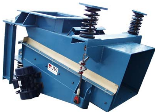
Electromechanical drive on a UPF feeder

Refer to bulletin UV2 for Technical Data