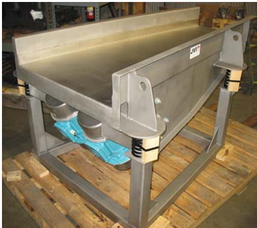
JVI drives on a feeder

By means of a frequency inverter, the speed of the unbalanced motors can be infinitely adjusted during operation. The frequency inverter is fully digital and microprocessor controlled. When switched off, a DC injection brake is energized for quick stopping.