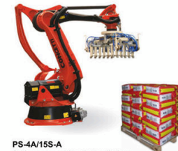
PS-4A/15S-A Anthropomorphic robot palletizer. Up to 700 bph