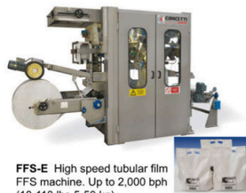
FFS-E High speed tubular film FFS machine. Up to 2,000 bph (10-110 lbs 5-50 kg).