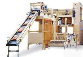
PS-AA/40S High level conventional palletizer. Up to 2,400 bph