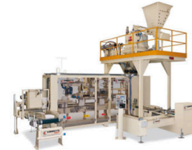
IGF fully automatic bag filler for preformed bags. Up to 1,200 bph (5-110 lbs 2-50 kg).