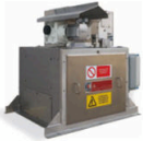
NET/G Gravity fed net weigher for free-flowing products.