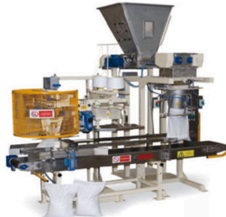
SEMIAUTOMATIC bag filler.