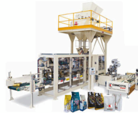
IMF high speed bagging line with double spout for preformed bags. Up to 1,800 bph (5-40 lbs 2-20 kg).