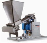
NET/CC Screw fed net weigher for powders.