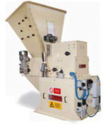
NET/N Belt fed net weigher for irregular shaped products.