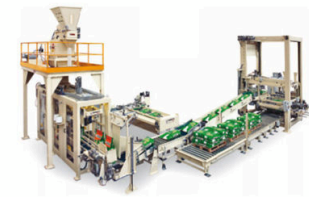
Turn-key packaging line with IGF machine and robot palletizer PS-3A/18S-4S