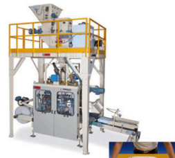
CONTINUA FFS Versatile tubular film FFS machine. Up to 1,800 bph (10-110 lbs 5-50 kg).