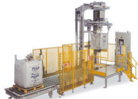
GROSS/B Big Bag gross weighing and filling system. Up to 30 big bph