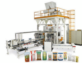
CAROUSEL equipped with six bagging stations. Fully automatic bag filler. Up to 1,200 bph with aerated products.