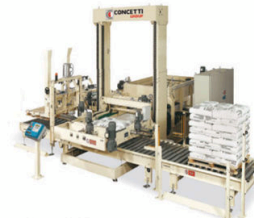
PS-AB/15S Low level conventional palletizer. Up to 900 bph