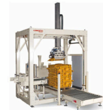
PS-4A/10S-P Gantry style robot palletizer. Up to 600 bph