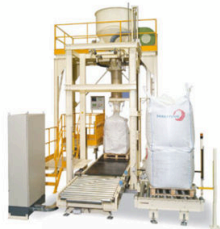
NET/B Big Bag net weighing and filling system. Up to 60 big bph