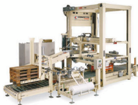
PS-3A/18S-4S Four column pick and place robot palletizer with plastic sheet applicator. Up to 1,200 bph