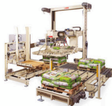
PS-3A/10S-2S Two column pick and place robot palletizer. Up to 750 bph