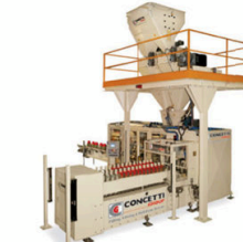
IPF fully automatic bag filler for preformed bags. Up to 2,400 bth with double spout. (1-20 lbs, 1-10 kg).