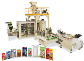
IGF+FFS combined solution for preformed bags and bags from PE tubular reel stock. Up to 1,200 bph (5-110 lbs 2-50 kg).