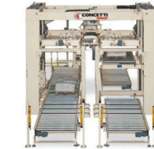
PS-AA-3A/18S Double pick and place palletizer. It works two pallets at the same time. Up to 1,000 bph