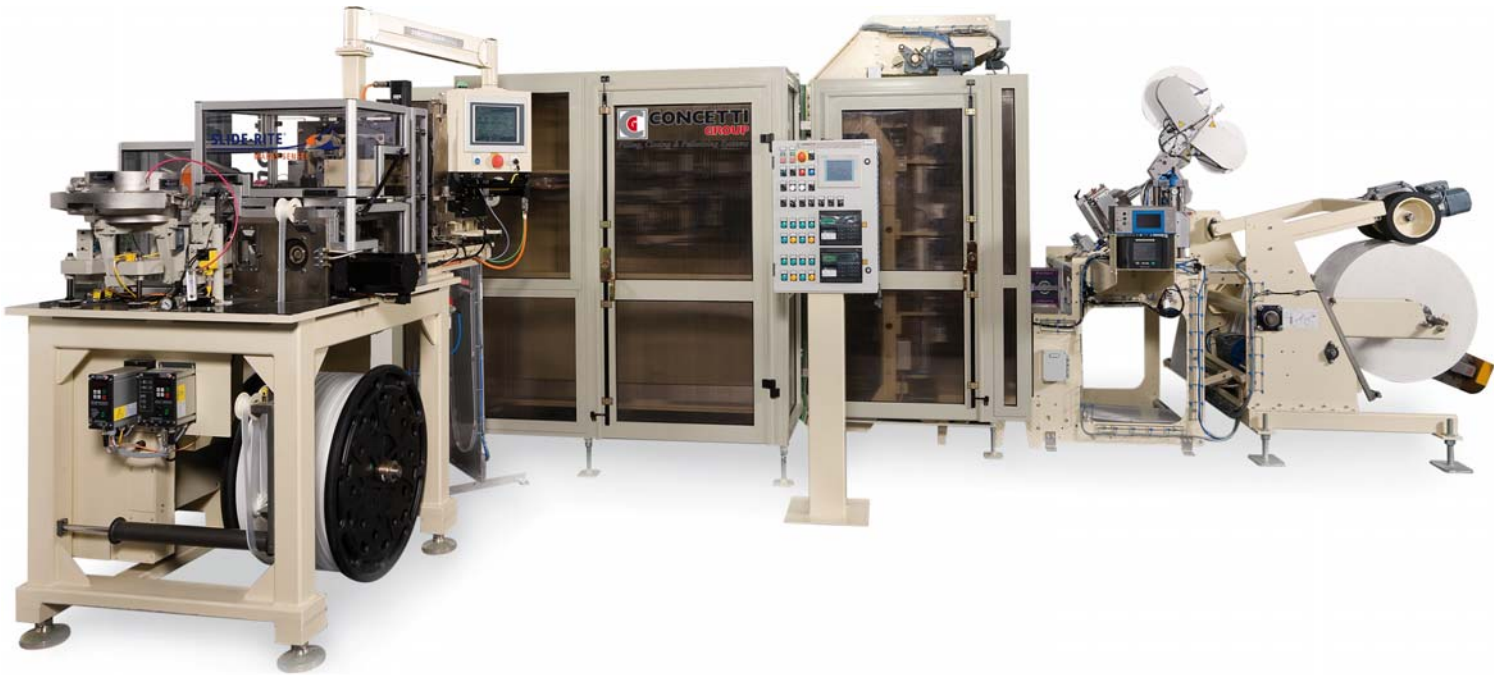
CONTINUA™ FFS for bags from a tubular reel