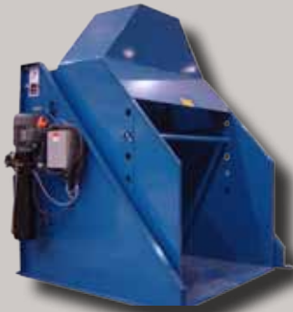
Standard Dumper with Funnel Chute