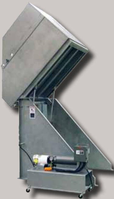
Stainless Steel Dumper