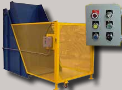
Standard Gated Enclosure - Auto Run Controls Available