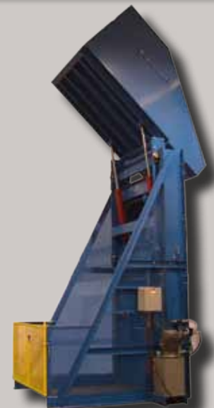
Lift and Dump