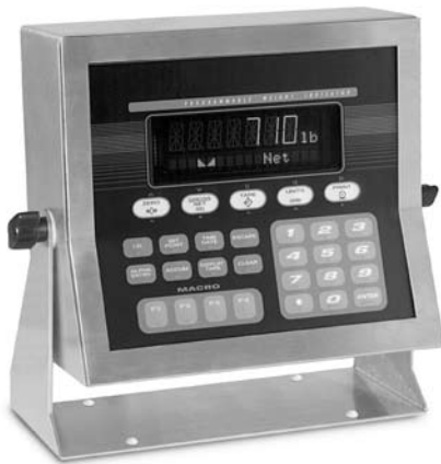
Sloped face model shown