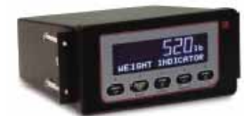
Desktop Panel Mount