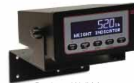
Desktop Wall Mount