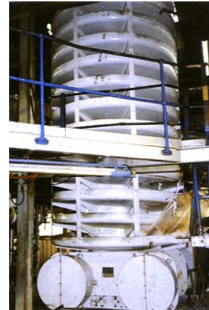
Spiral Elevators for gentle vertical conveying