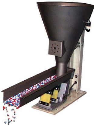
Dosing Feeders with optional integrated hoppers