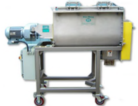
Stainless contact mixer 8 cu. ft. (225 liters) capacity, port discharge, used for powdered paint.