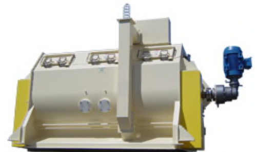
Carbon Steel with AR400 paddles, 225 cu. ft. (6370 liters) capacity, heavy duty discharge used for animal feed probiotic.

Demonstration units & CD presentations are available by request